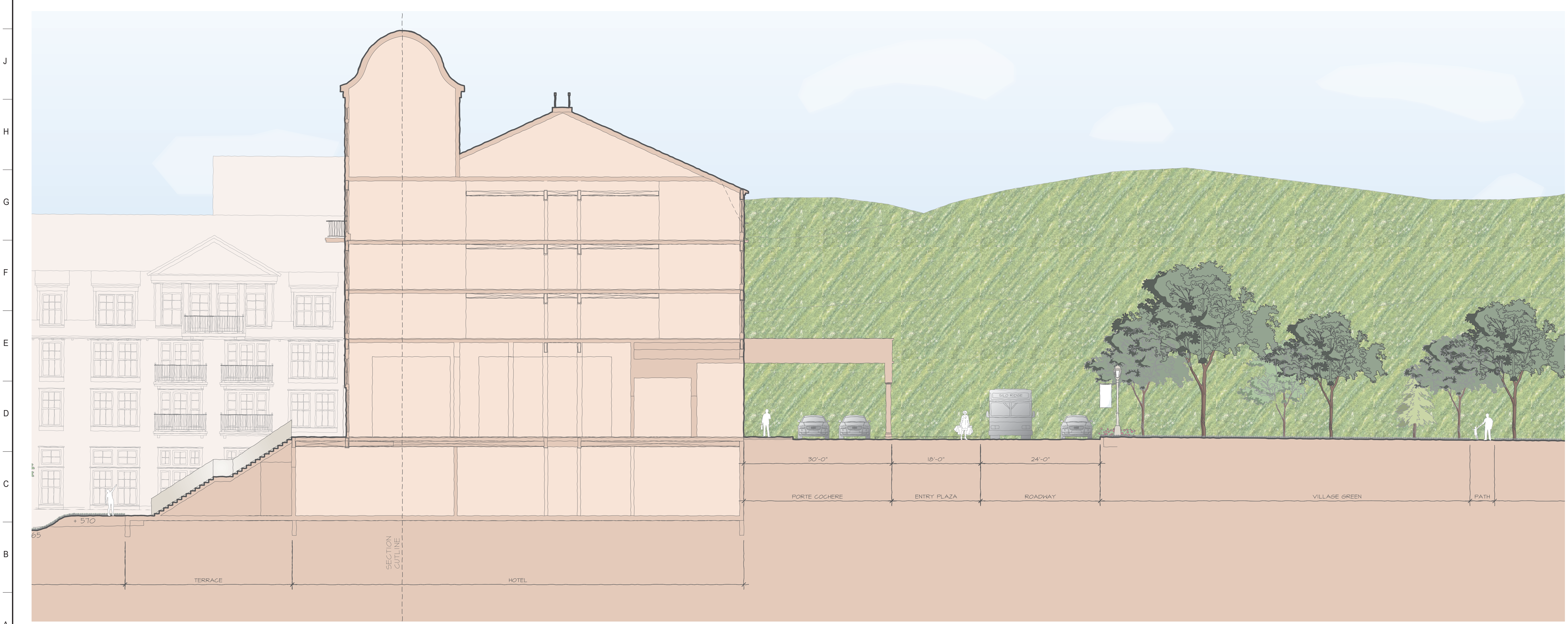
A1 SECTION THROUGH HOTEL LAWN & GARDENS SCALE: 1/8" = 1'-0"