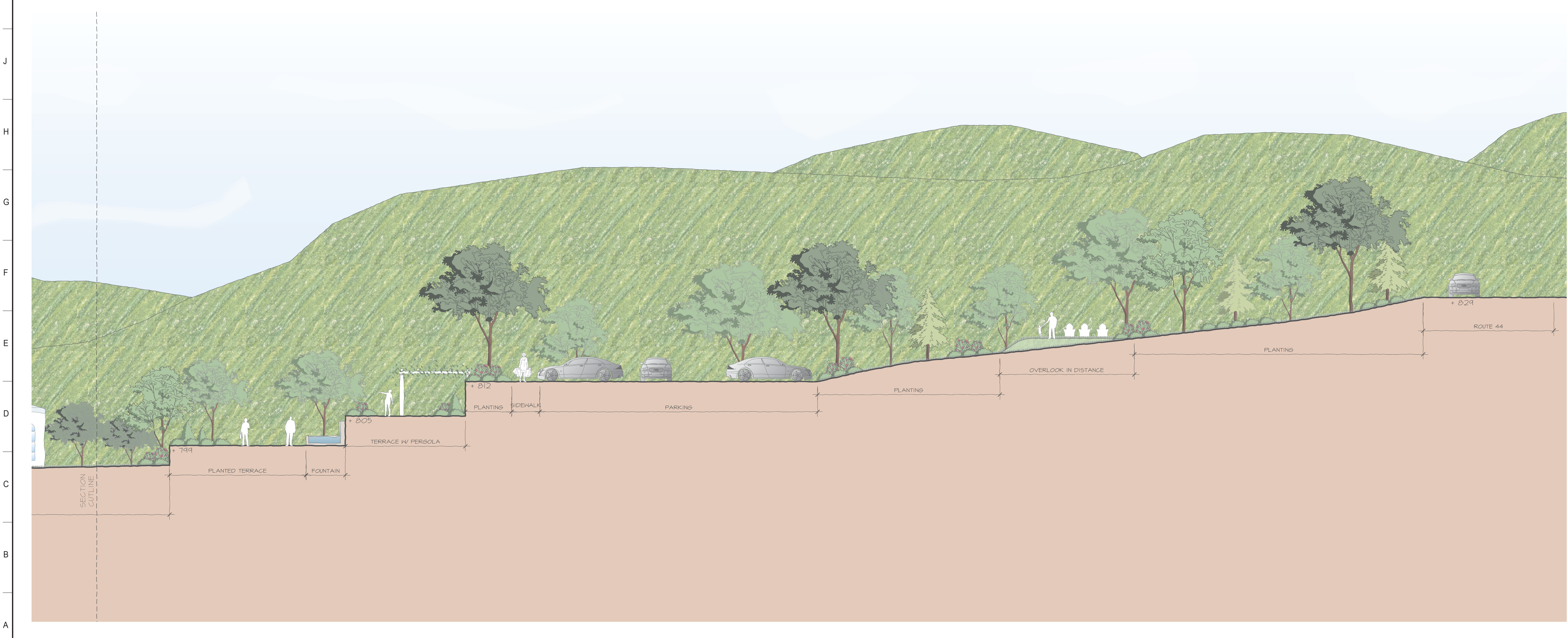
A1 SECTION THROUGH WINERY SCALE: 1/8" = 1'-0"