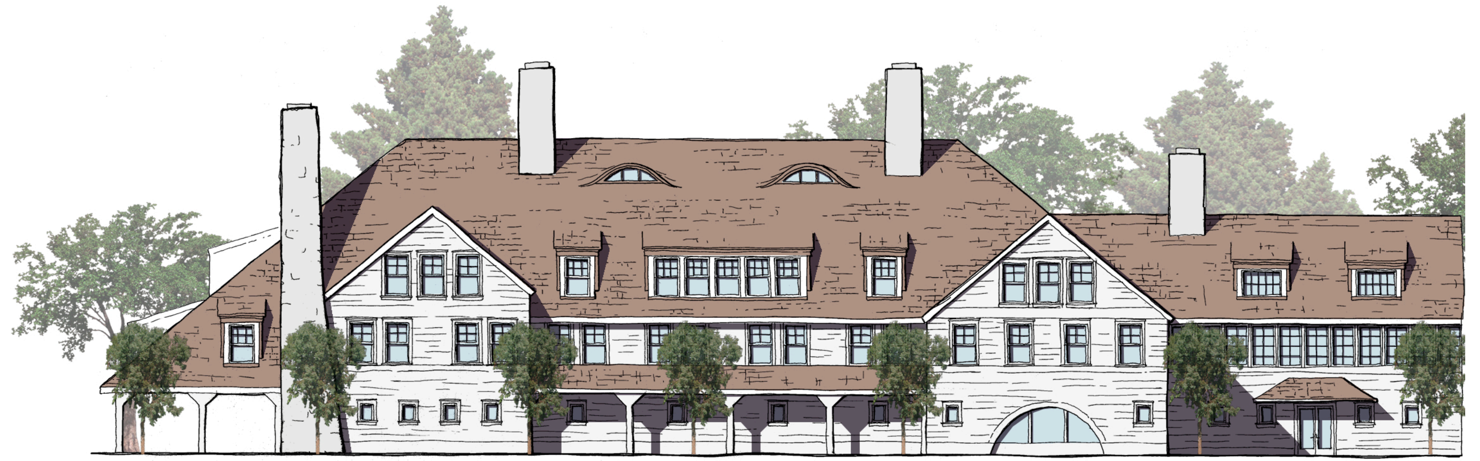
③ SPA WEST ELEVATION: BUILDING R-2 SCALE: 1/16"=1'-0"