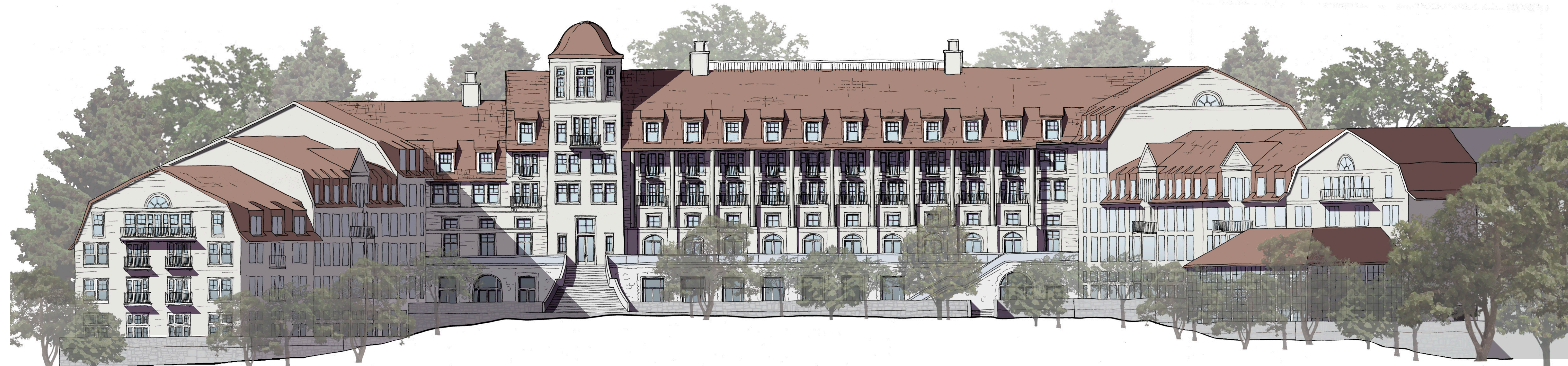
① HOTEL SOUTH ELEVATION: BUILDING R-1 SCALE: 1/16"=1'-0"