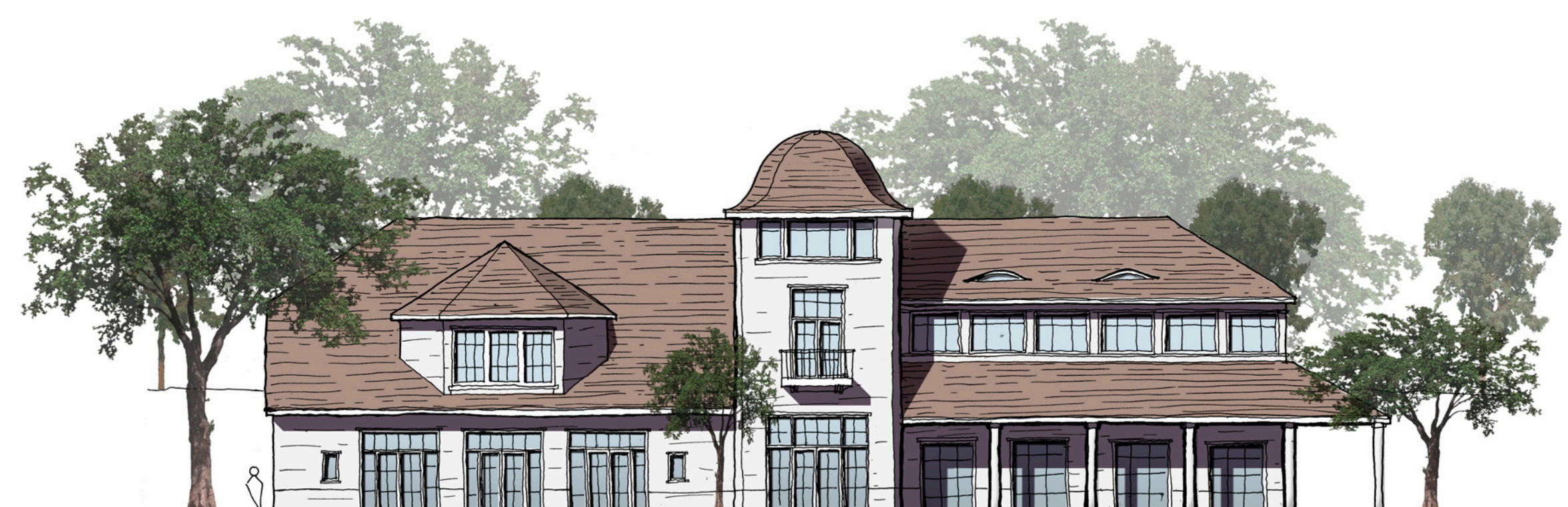
④ CONFERENCE CENTER SOUTH ELEVATION: BUILDING R-3 SCALE: 1/16"=1'-0"