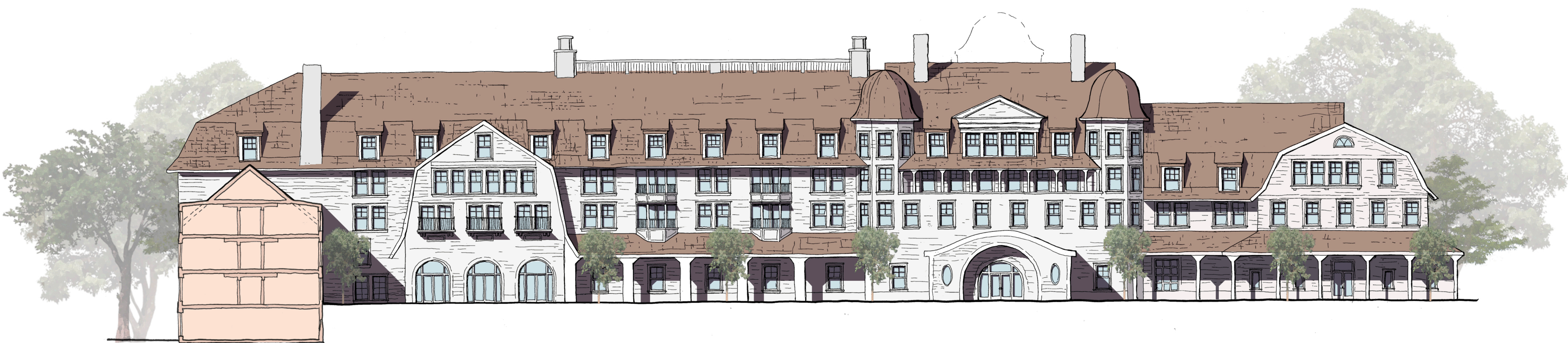
② HOTEL NORTH ELEVATION: BUILDING R-1 SCALE: 1/16"=1'-0"