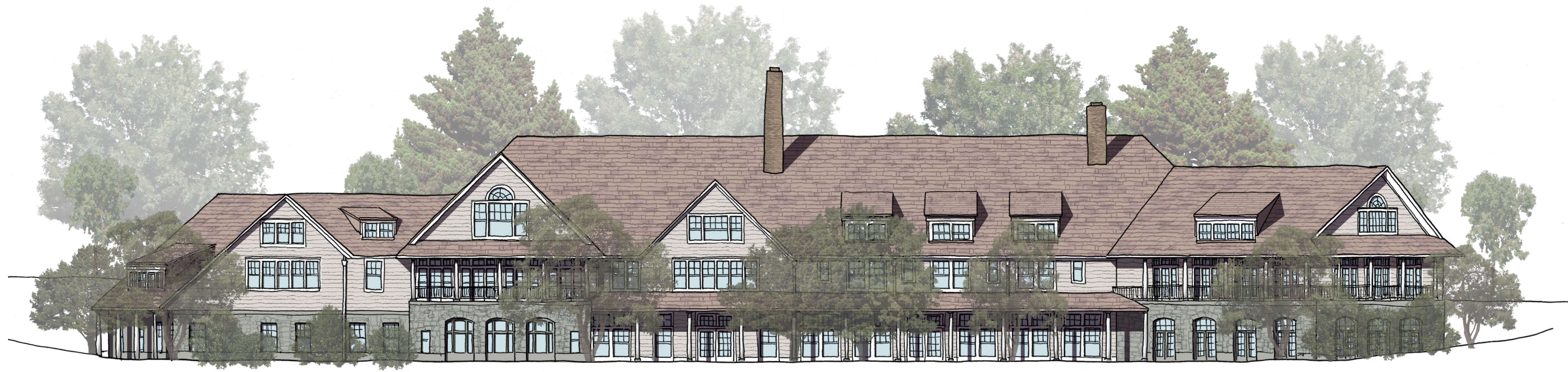
1 GOLF CLUBHOUSE SOUTH ELEVATION SCALE: 1/16"=1'-0"