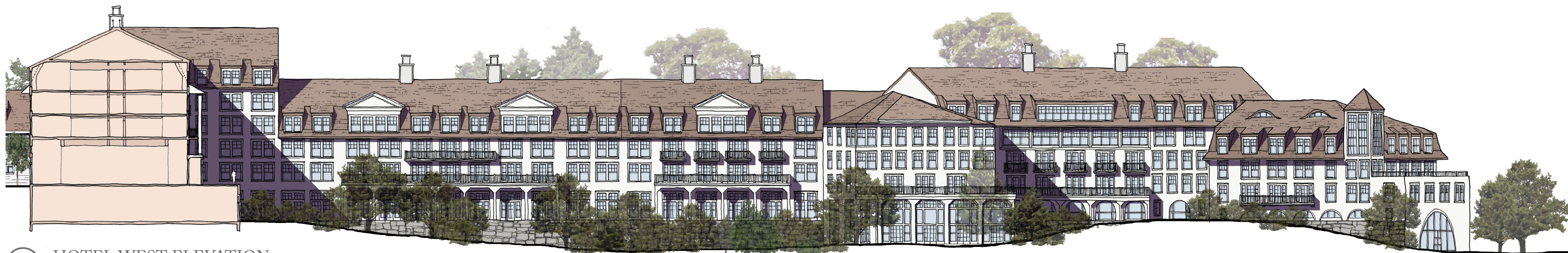
2 HOTEL WEST ELEVATION SCALE: 1/32"=1'-0"