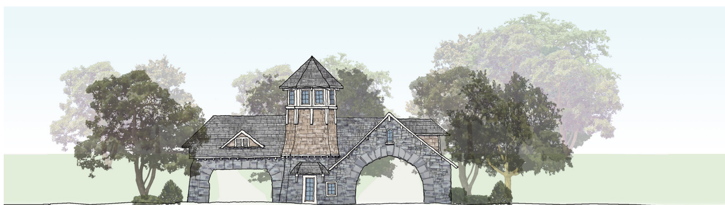
3 WELCOME HOUSE EAST ELEVATION SCALE: 1/16"=1'-0"