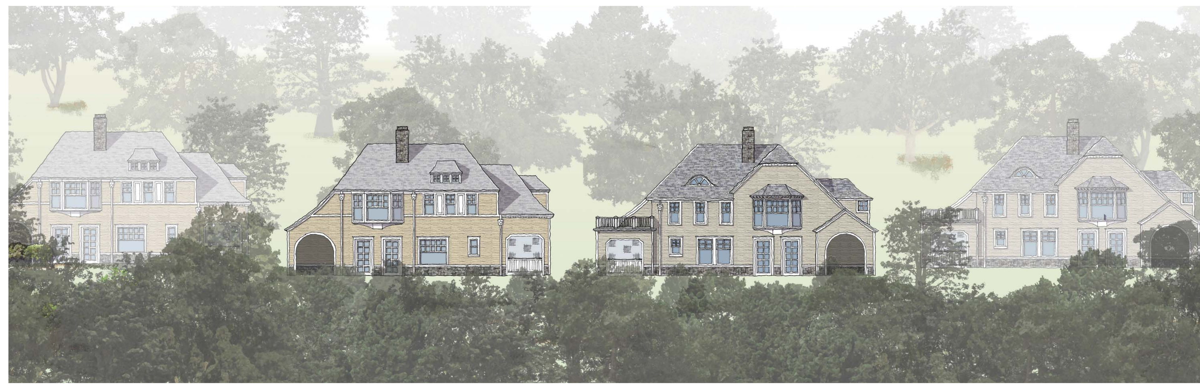
1 VINEYARD COTTAGE SOUTH ELEVATION SCALE: 1/16"=1'-0"