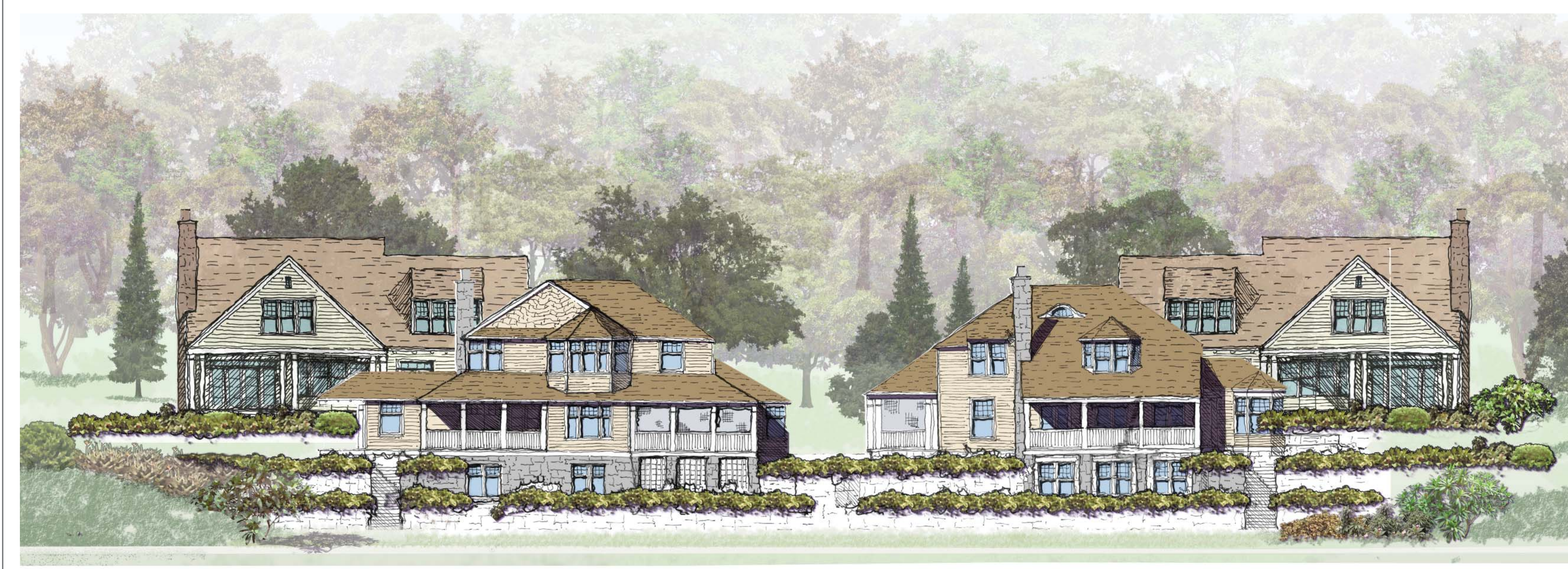
2 GOLF VILLA EAST ELEVATION SCALE: 1/16"=1'-0"