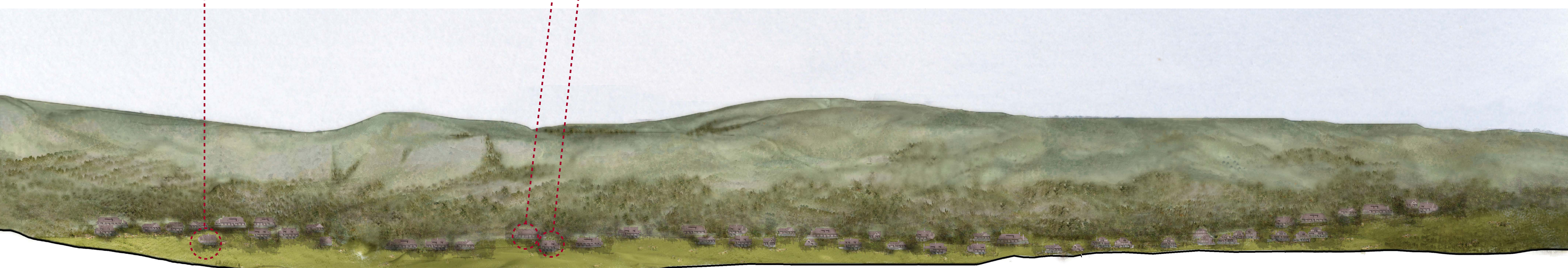
5 HILLSIDE EAST ELEVATION: ESTATE HOUSES AND GOLF VILLAS SCALE: N.T.S.