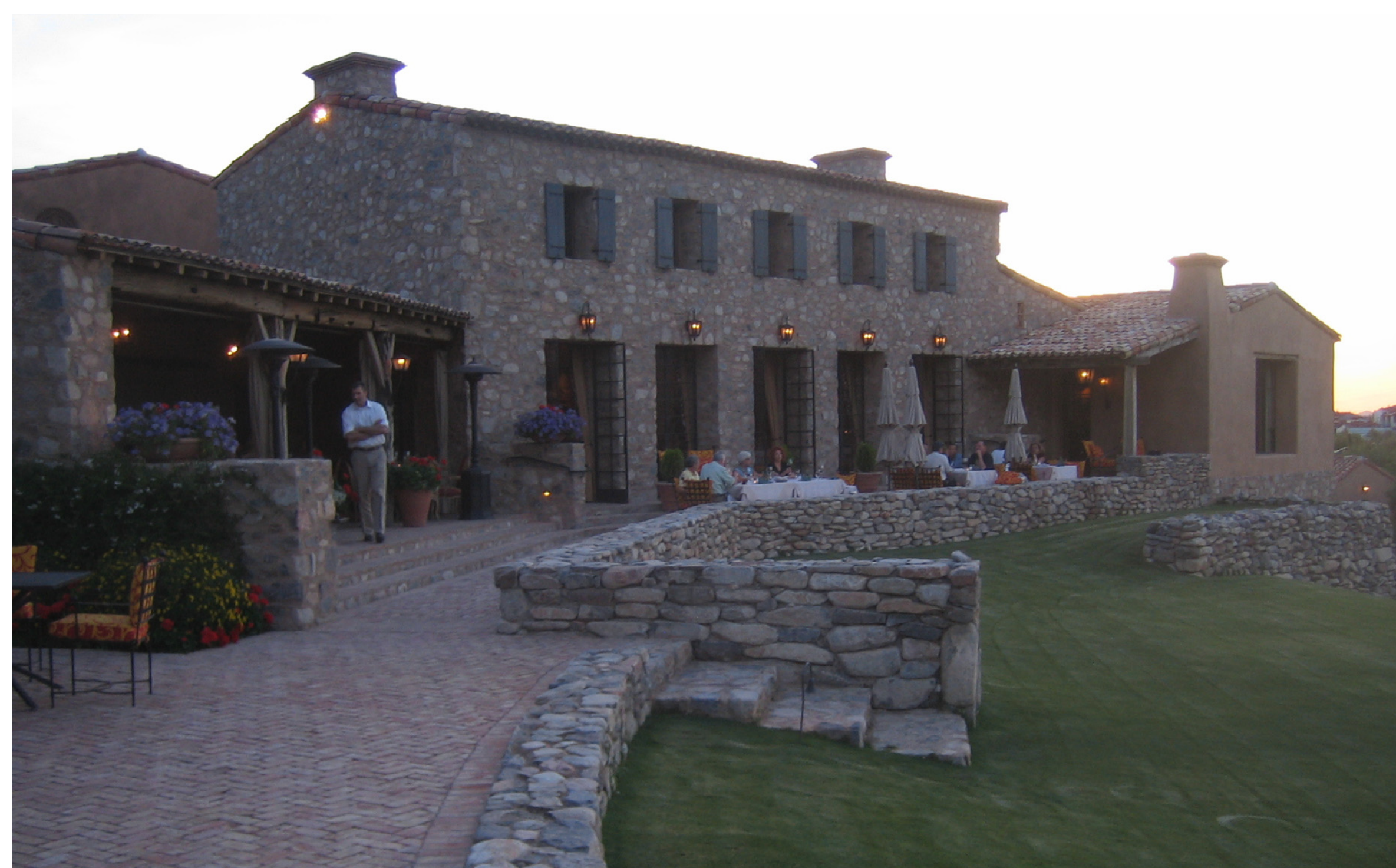
Outdoor Dining, Silverleaf Clubhouse, AZ