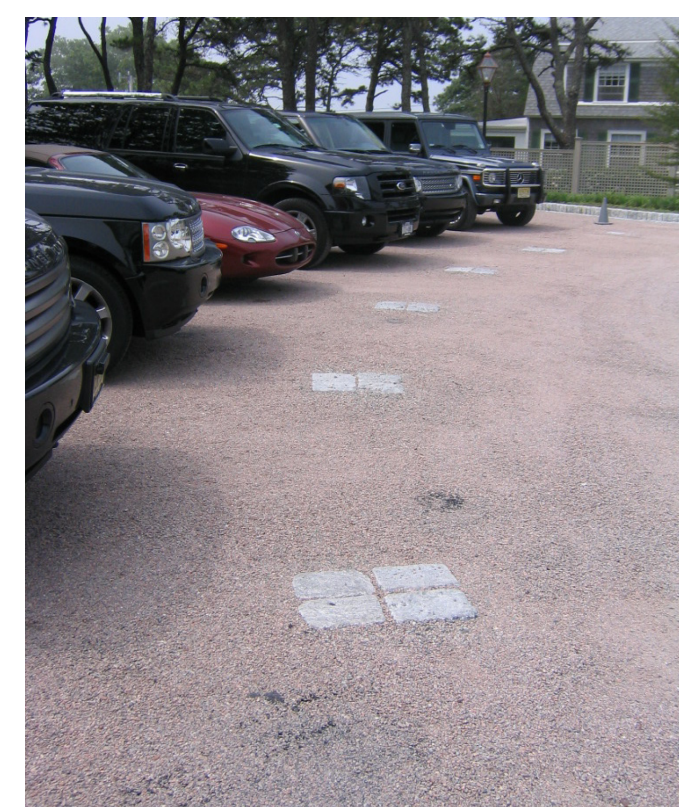
Gravel Parking with Paving Detail, Cape Cod--Winery Parking Lot