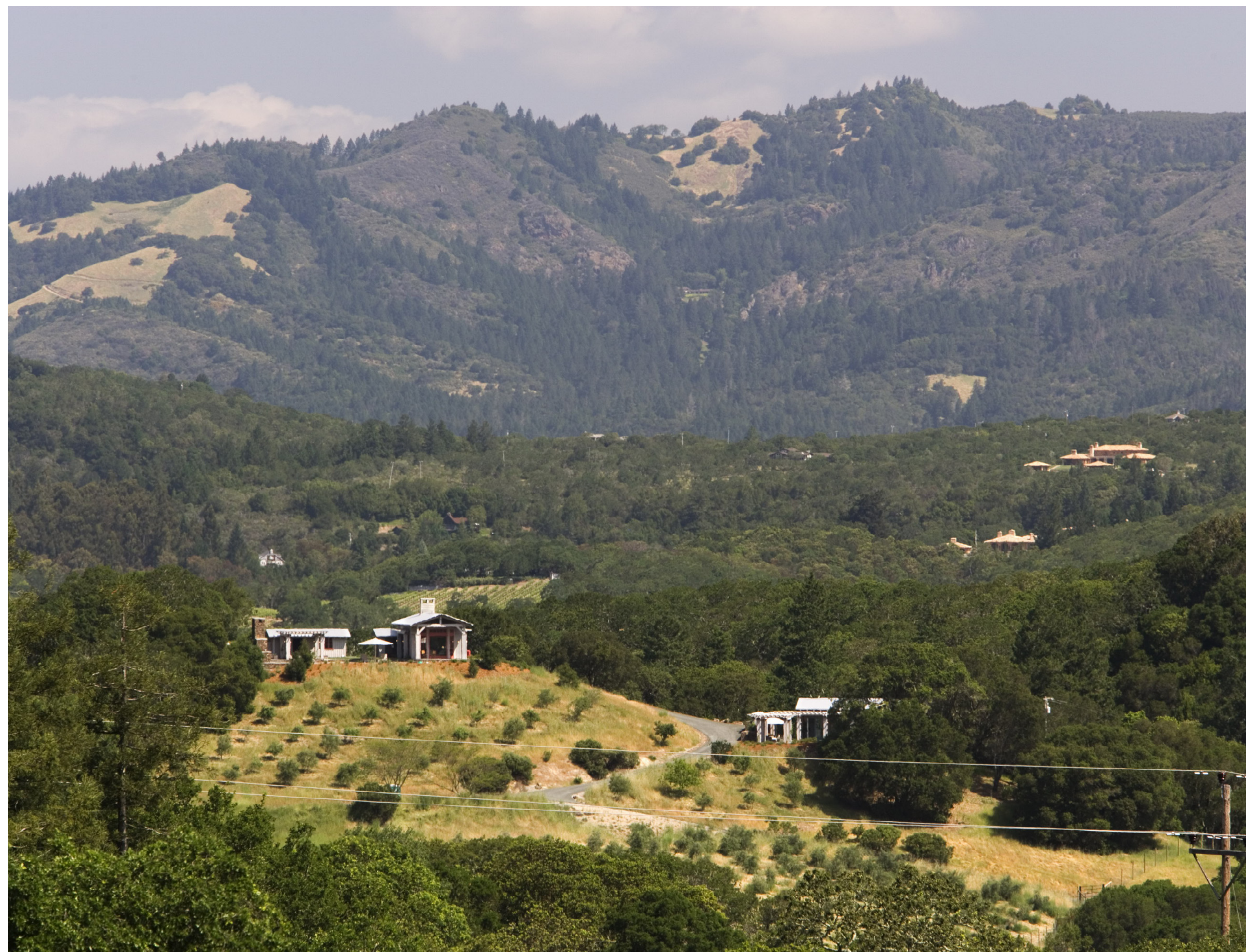
View, Glen Ellen, CA