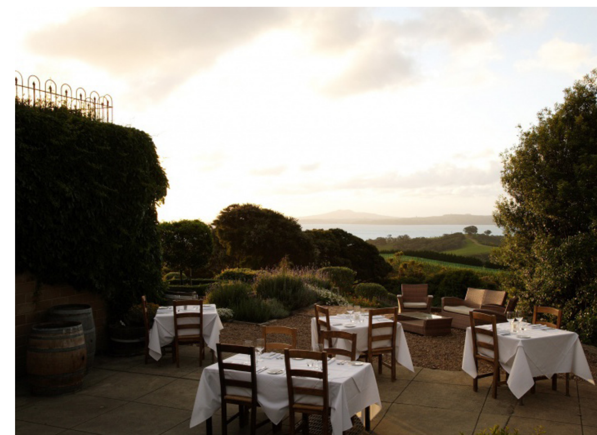
Outdoor Dining, Mudbrick Island Waiheke Island, New Zealand