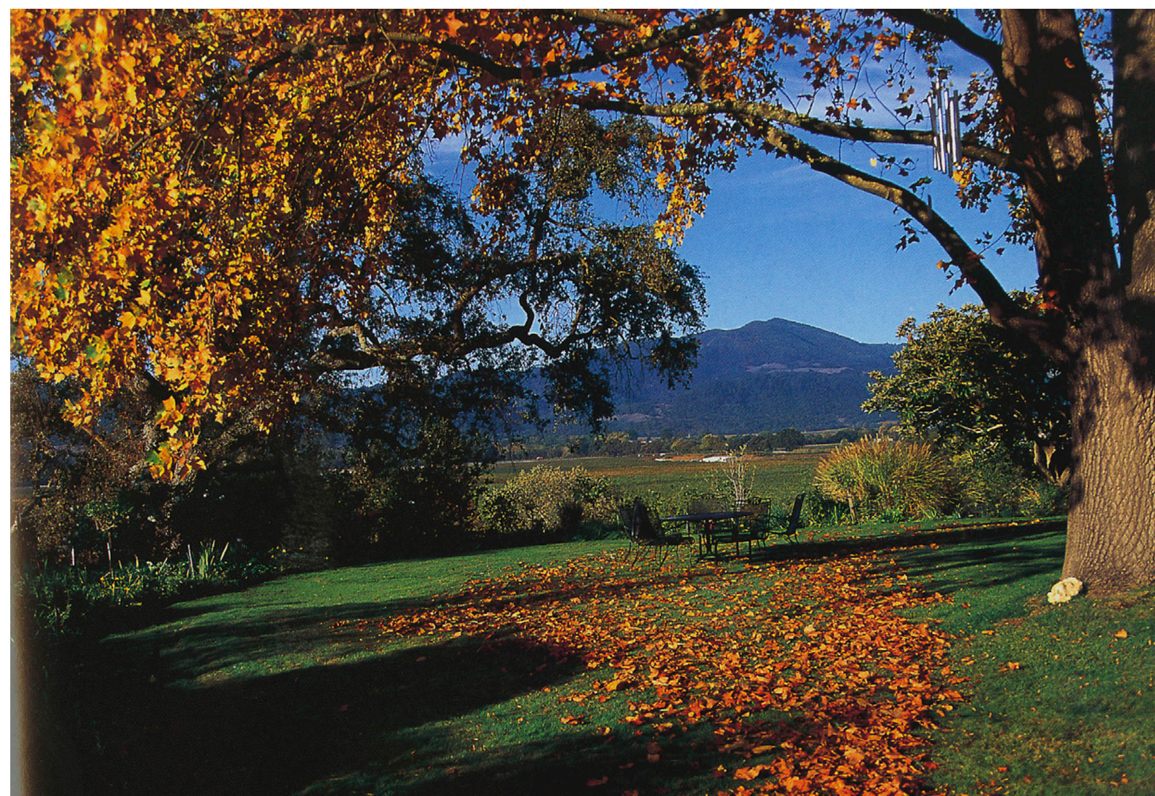
View of Distant Hills and Valley--Winery Lawn