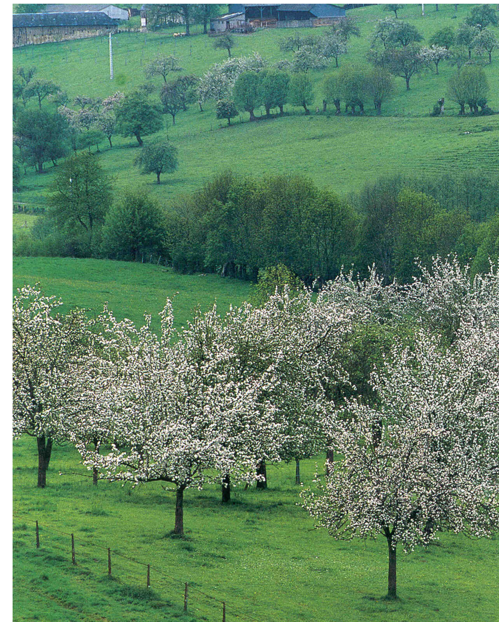
Orchard, Auge, Lisieux