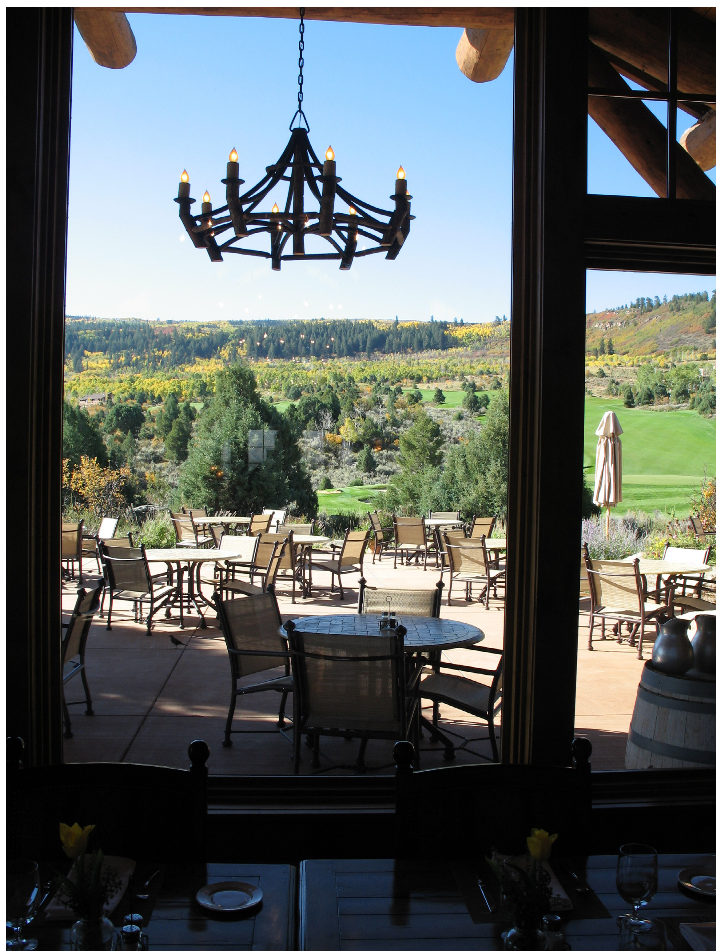
Interior & Exterior Seating with View Red Sky Golf Club House, CO