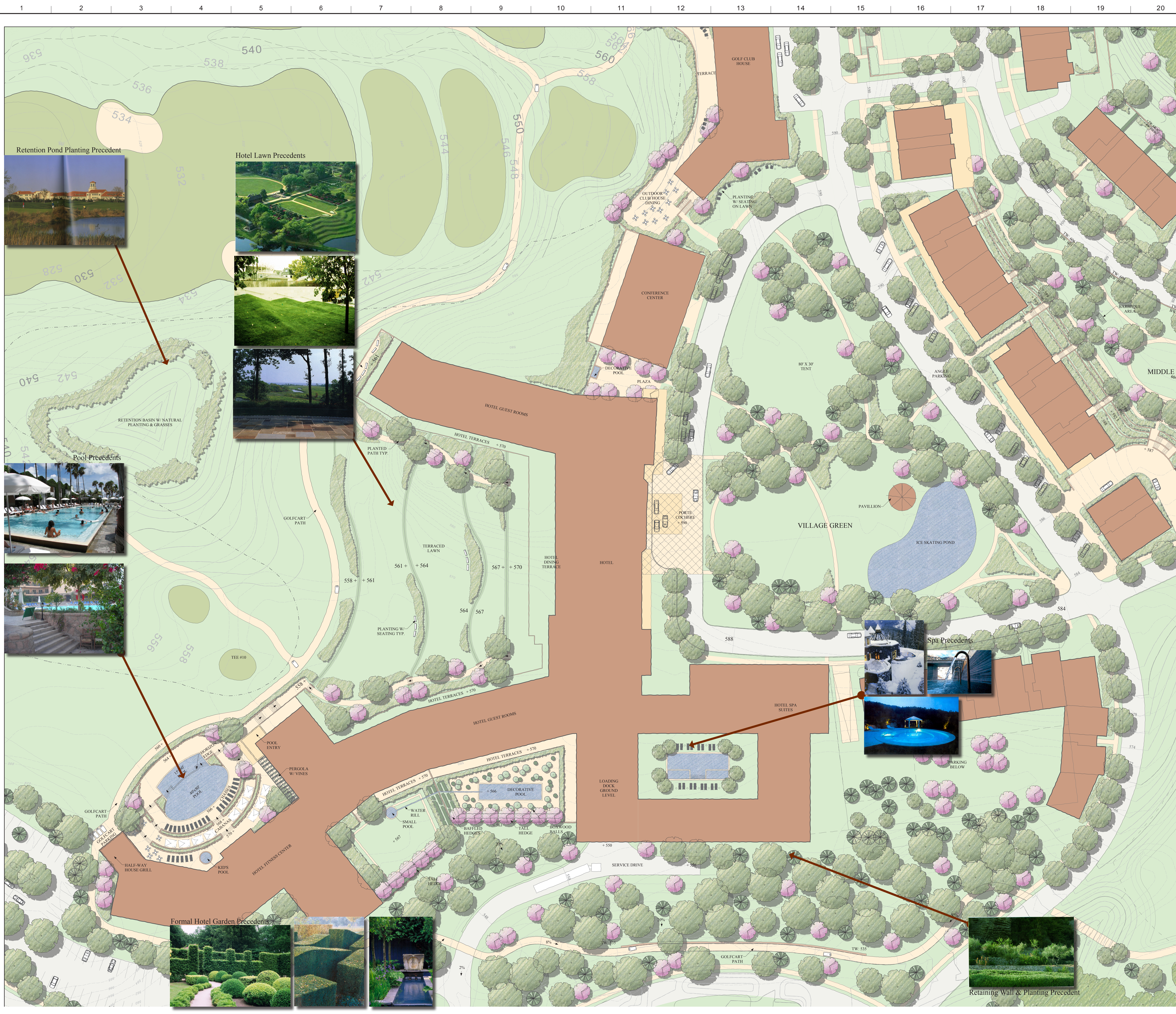
Retention Pond Planting Precedent