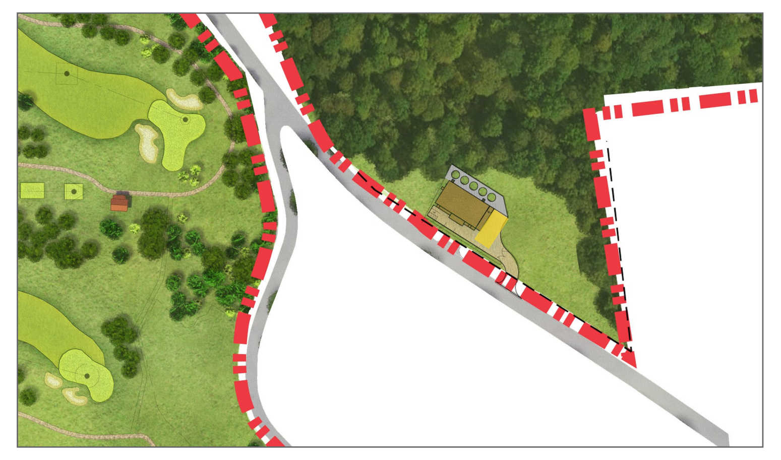
WWTP PLAN (NTS)