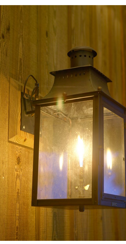
Wall-Mount Light Fixtures (Glowing)