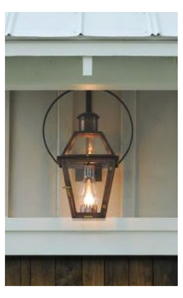
Arm-Mounted Wall Sconce (Glowing)