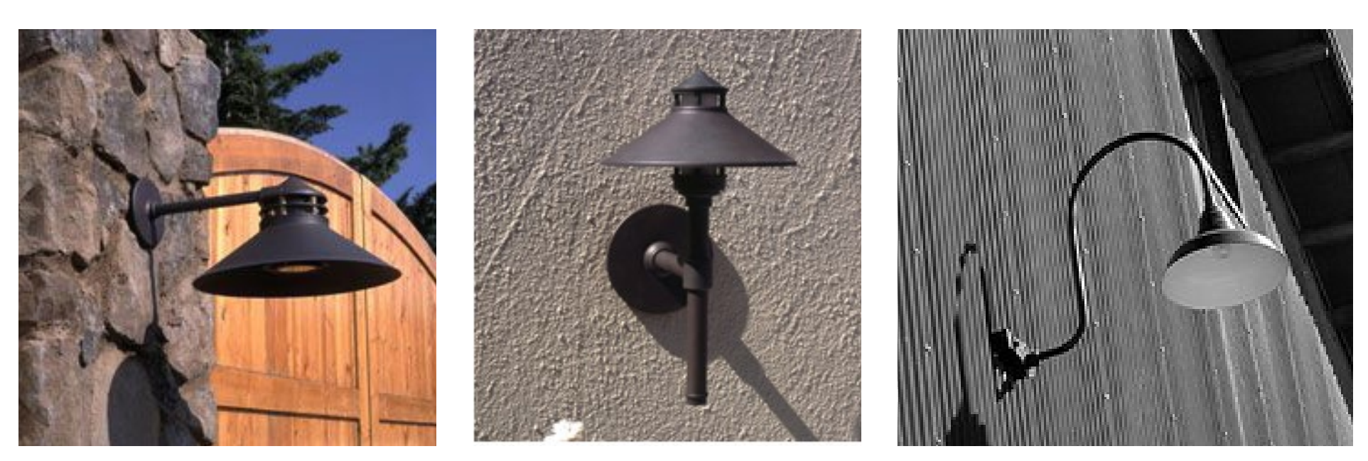
Wall-Mounted Light Fixtures (Shielded)