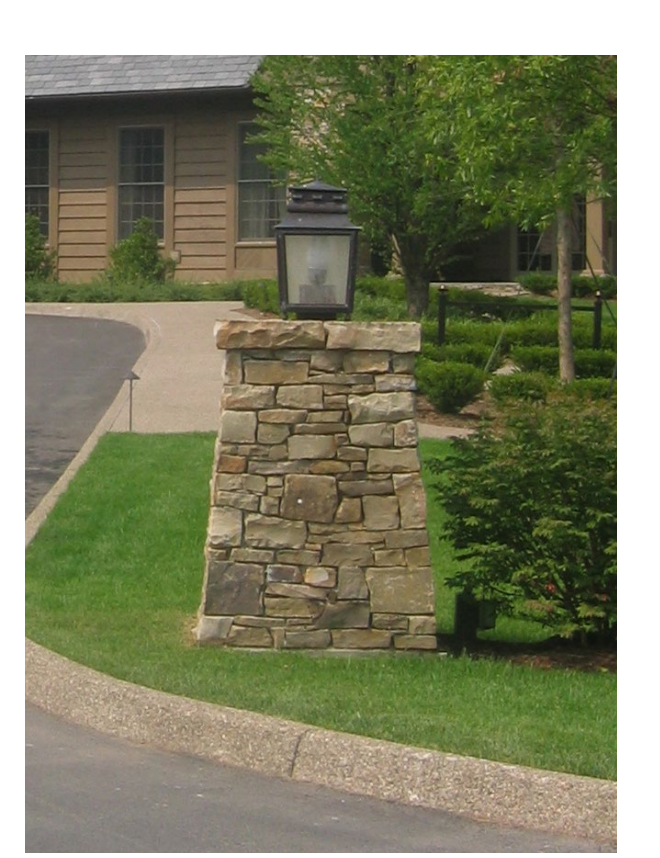
Bollard or Special Lighting