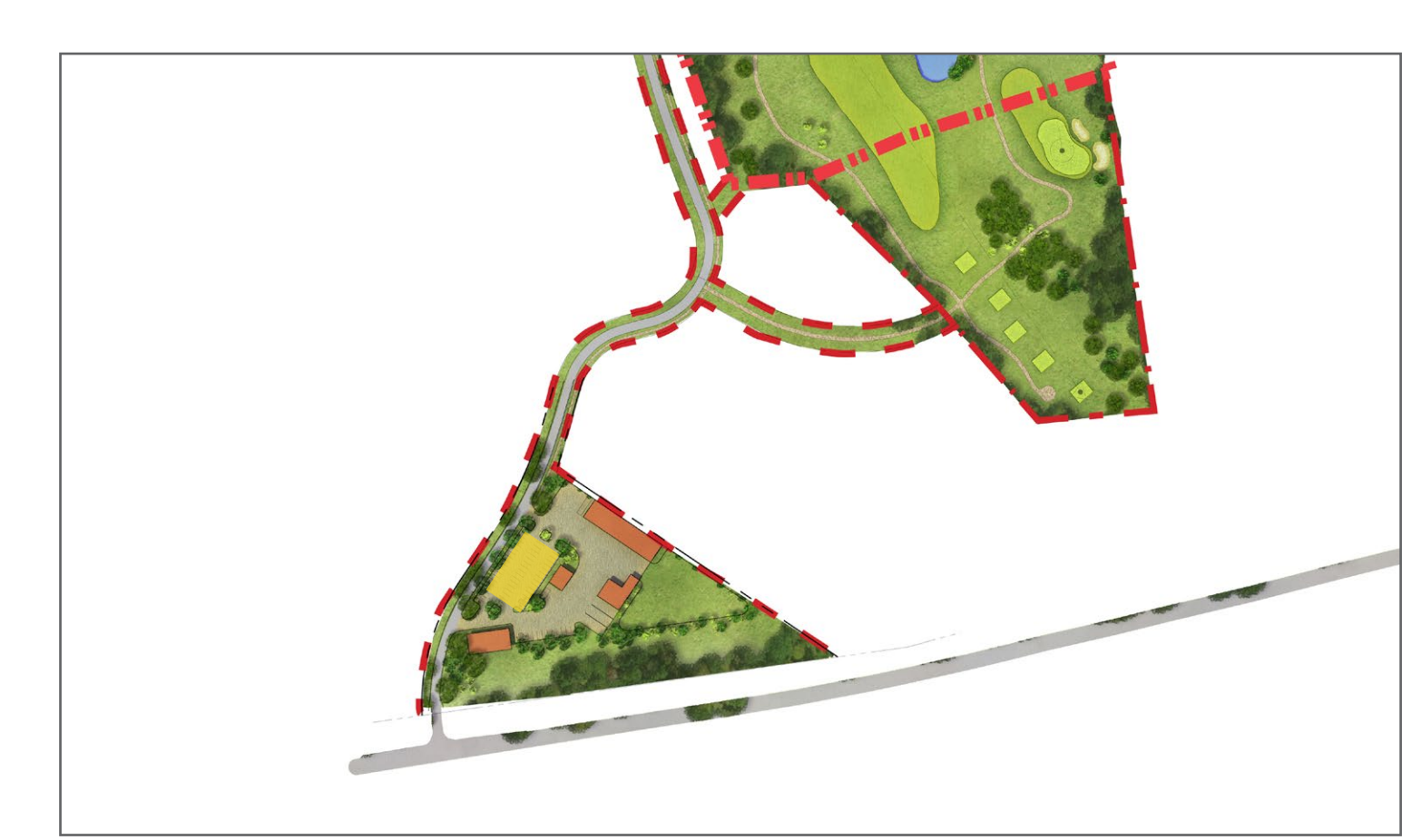
MAINTENANCE FACILITY PLAN (NTS)