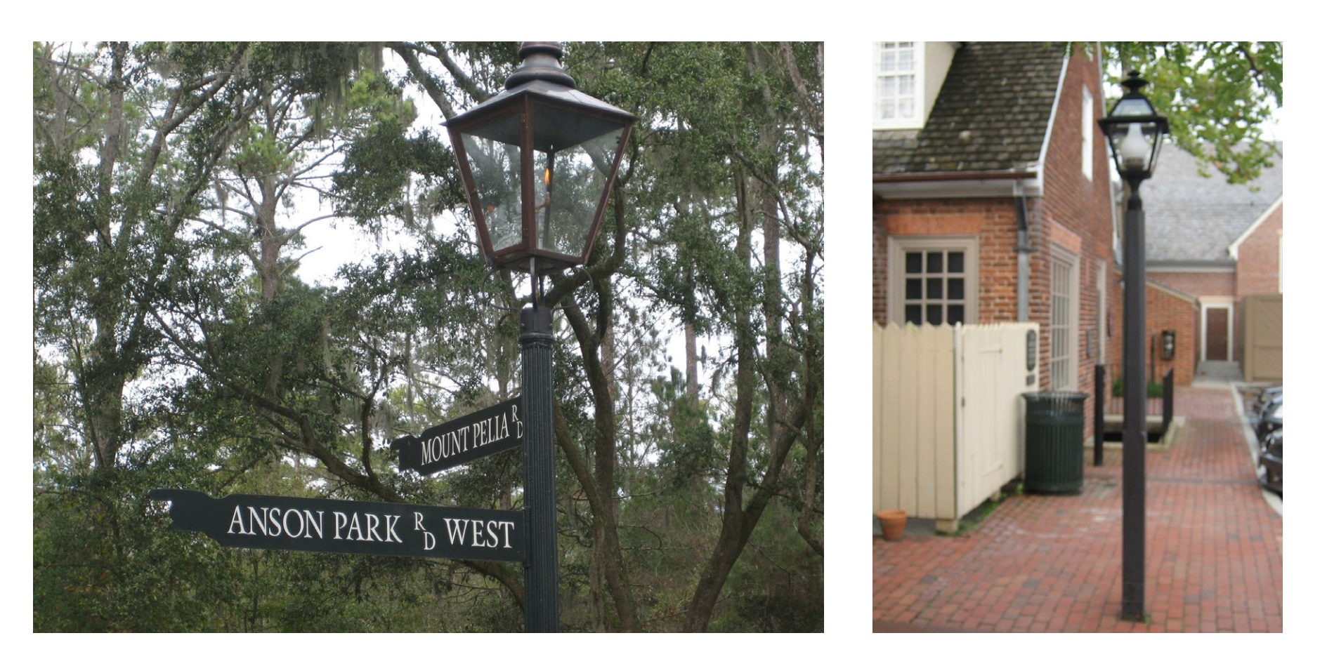
Pole-Mounted Light Fixtures

For more detail on lighting requirements please refer to Appendix E "Lighting" and Section 2.5 "Lighting" of the Amended Master Development Plan.