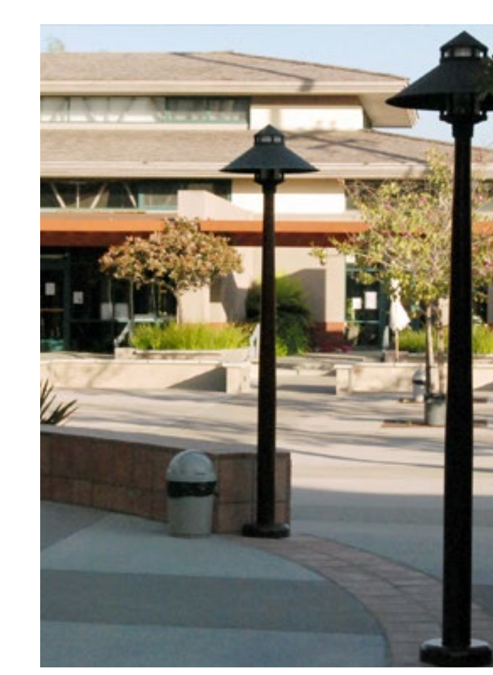
Pole-Mounted and Single (Bracket) Arm Light Fixtures