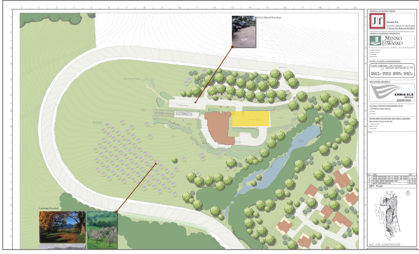
WINERY PLAN (NTS)