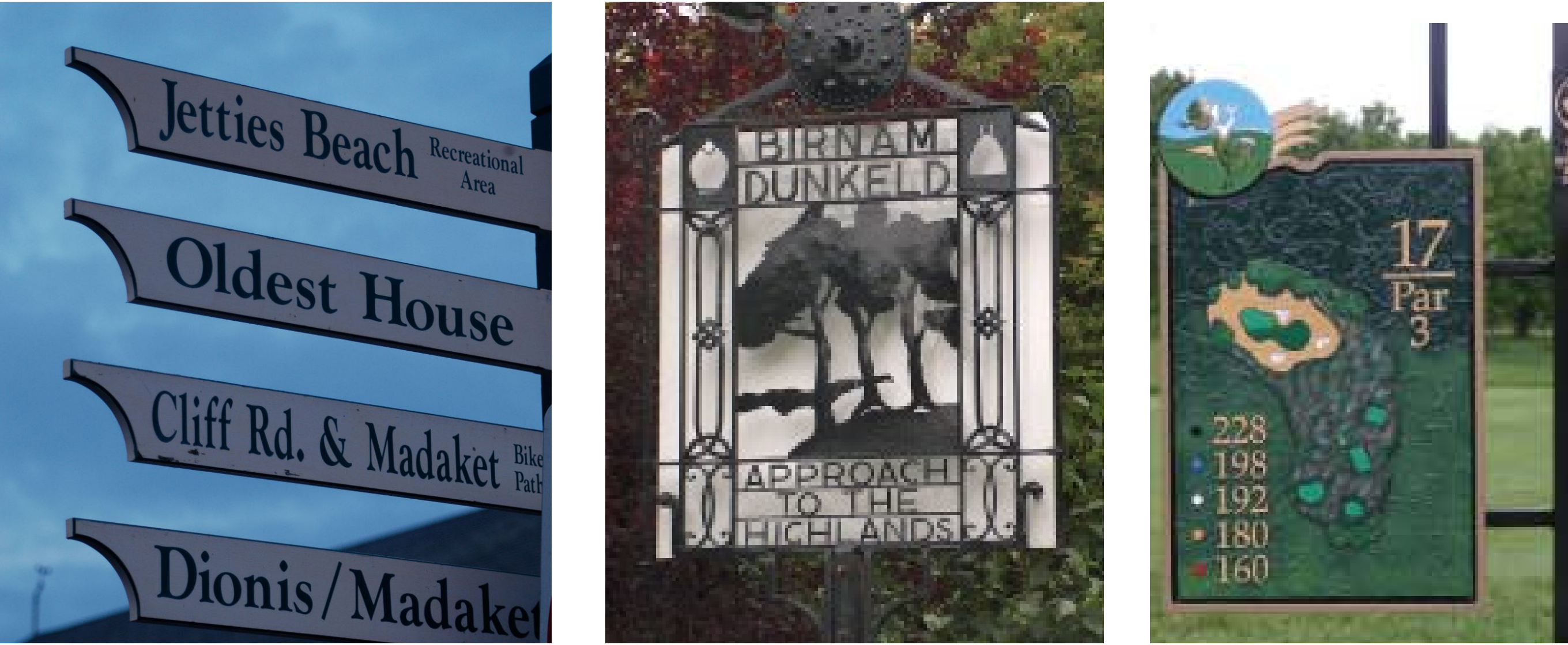
Project Informational Signs

An example of Discovery Land Company’s comprehensive approach to site design is illustrated in the signage examples for the Yellowstone Club and other Discovery projects included here. These images are intended to illustrate an approach to signage and are not intended to specify design.