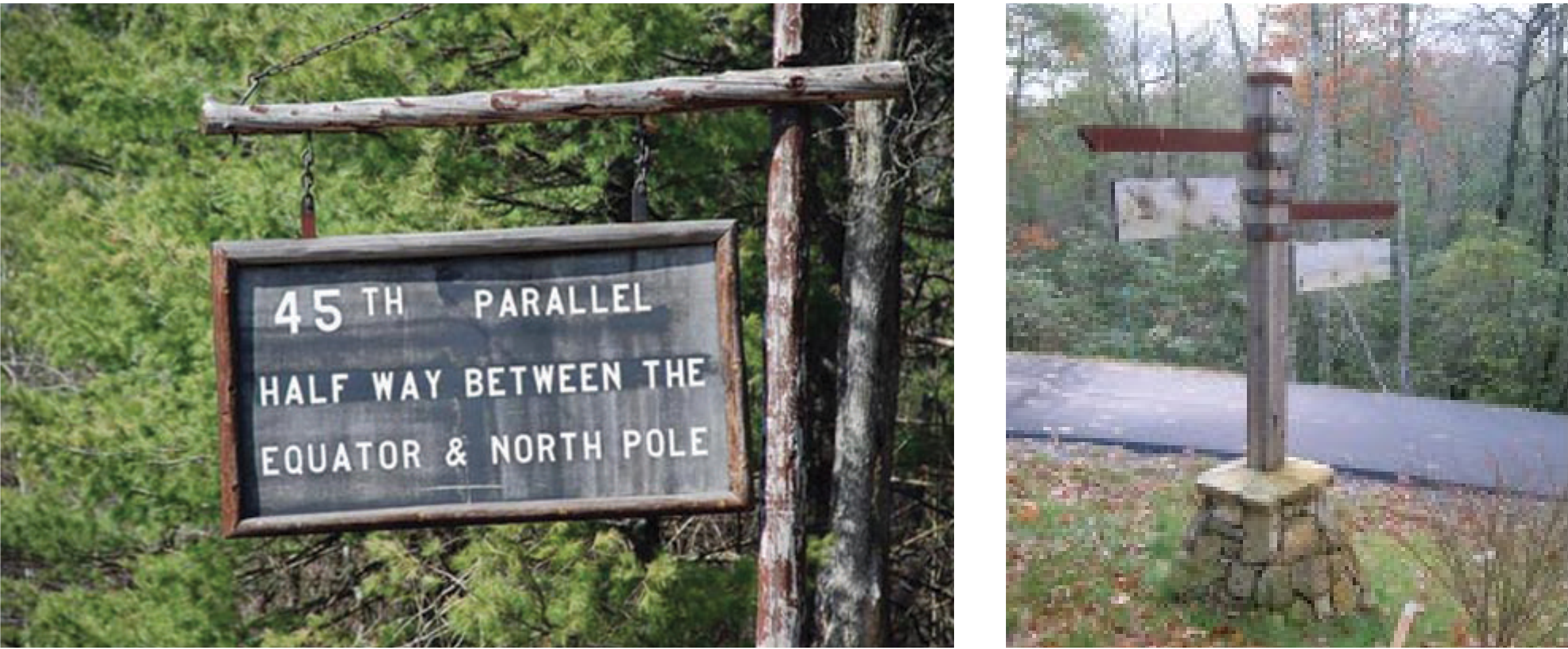
Project Circulation Identification