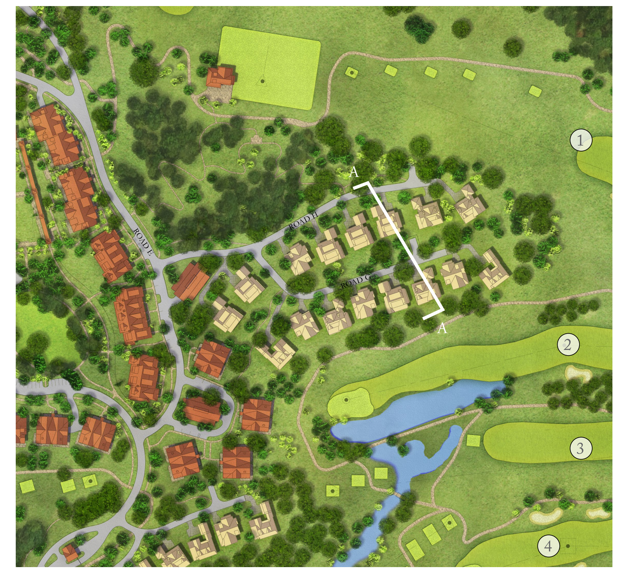
KEY PLAN (NOT TO SCALE)