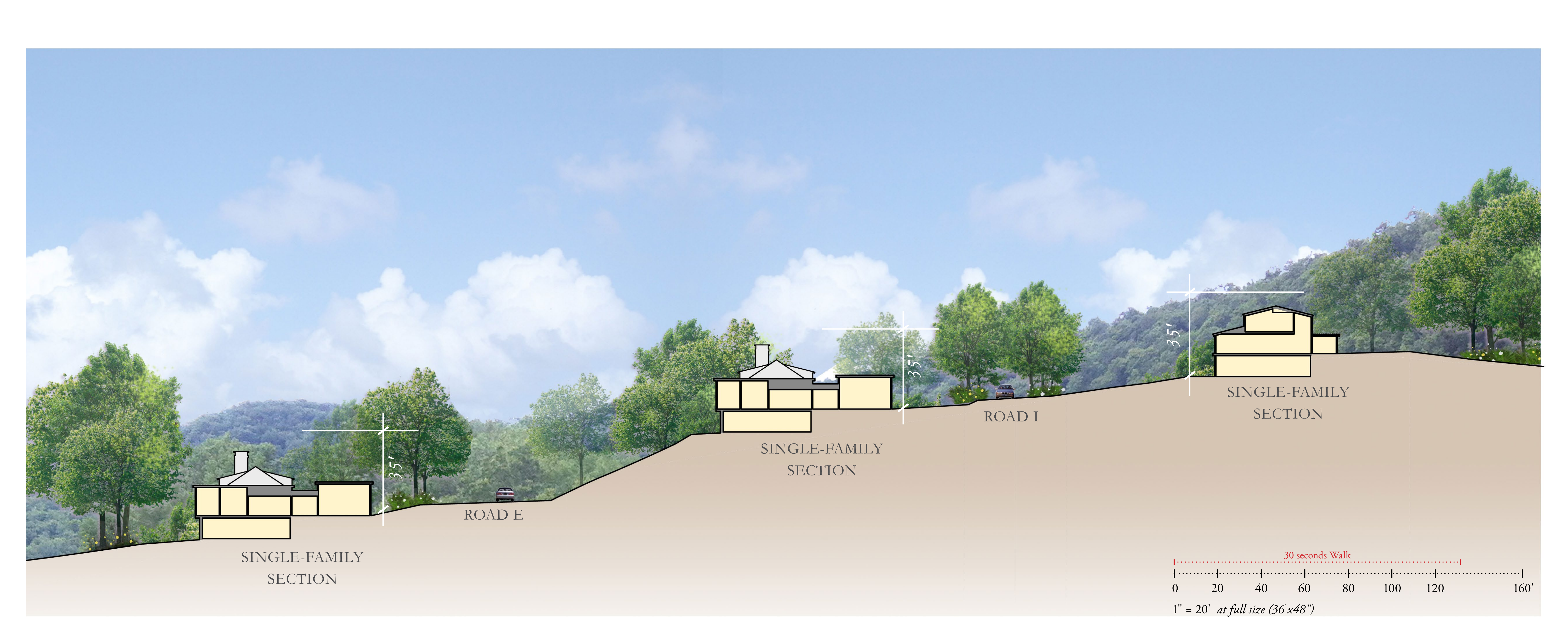
SITE SECTION HH - GOLF VILLAS