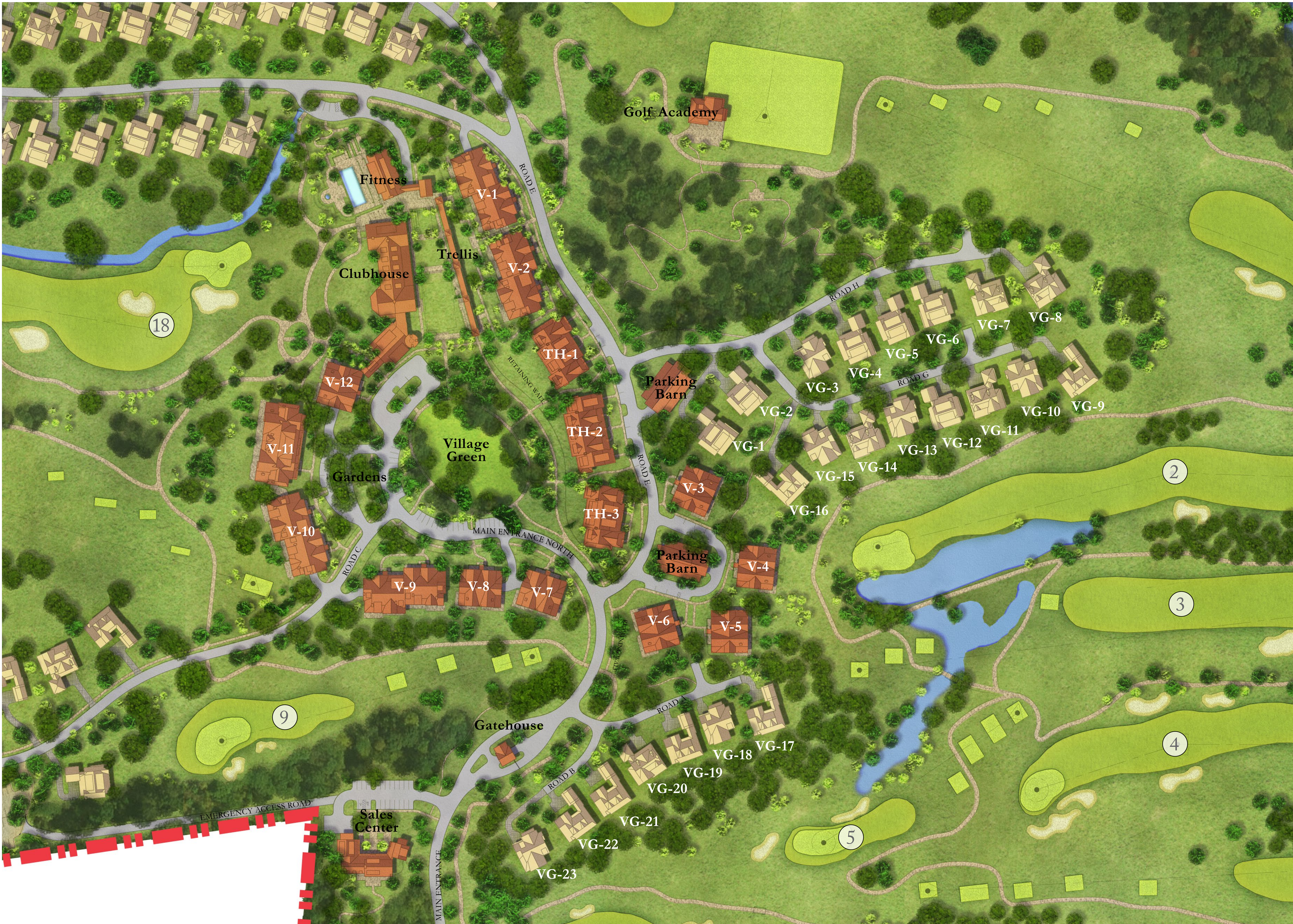
SITE PLAN - VILLAGE GREEN