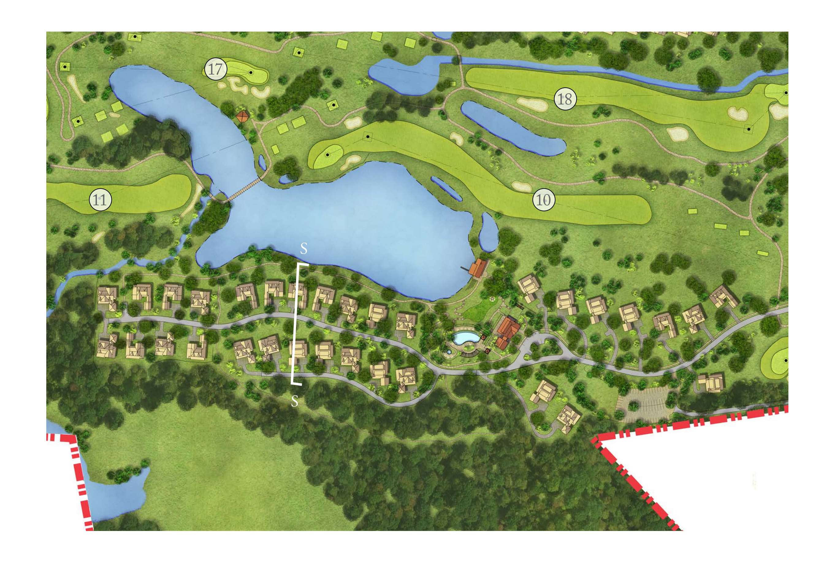
KEY PLAN (NOT TO SCALE)

OWNER: Silo Ridge Ventures, LLC 5021 Route 44 Amenia, New York 12501 845.373.8020