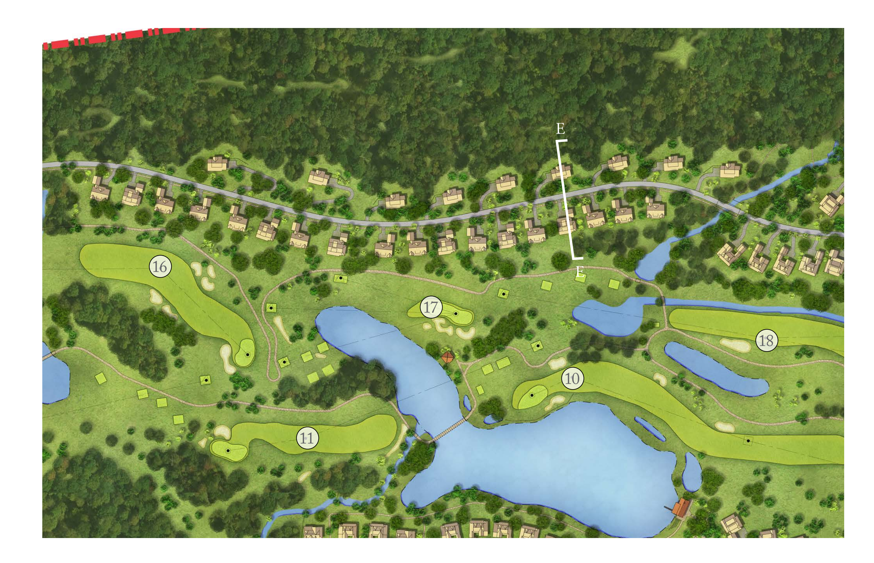
KEY PLAN (NOT TO SCALE)

OWNER: Silo Ridge Ventures, LLC 5021 Route 44 Amenia, New York 12501 845.373.8020