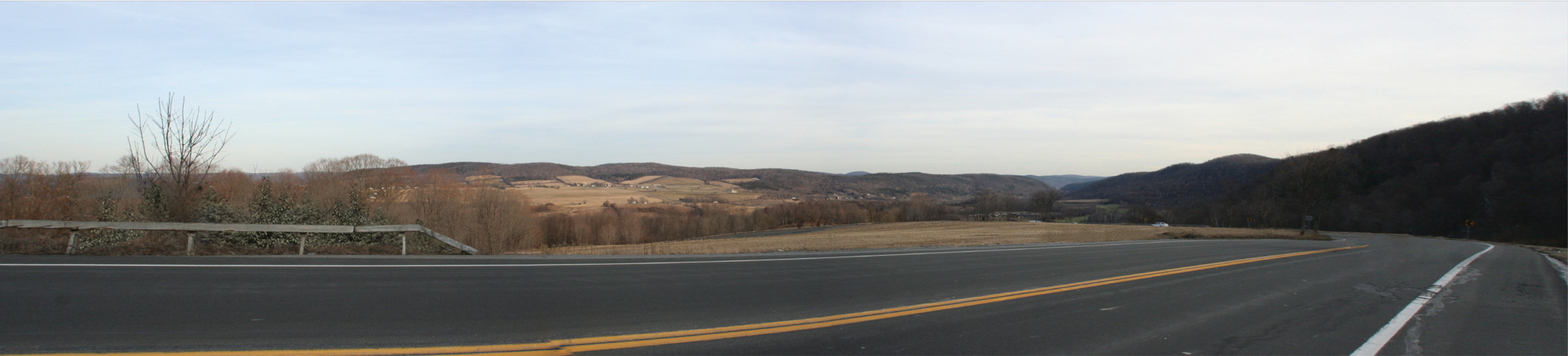
PERSPECTIVE LOOKING EAST