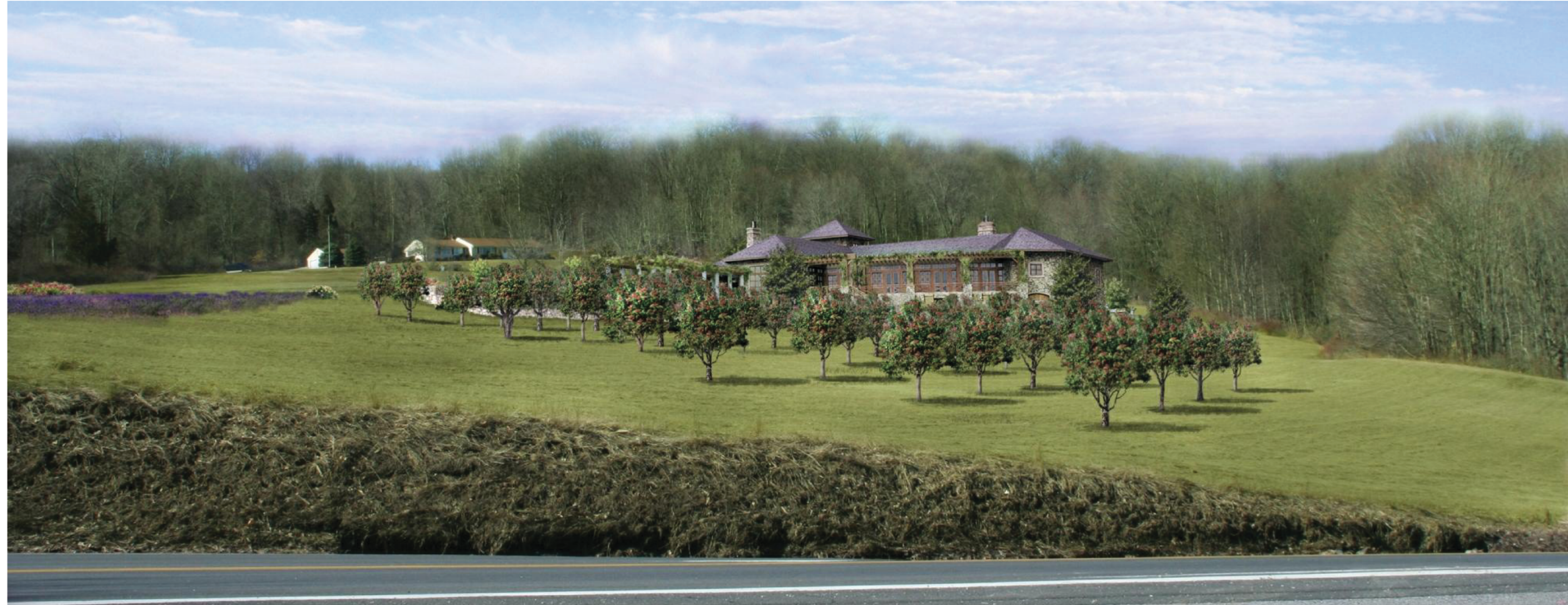
PERSPECTIVE LOOKING NORTH